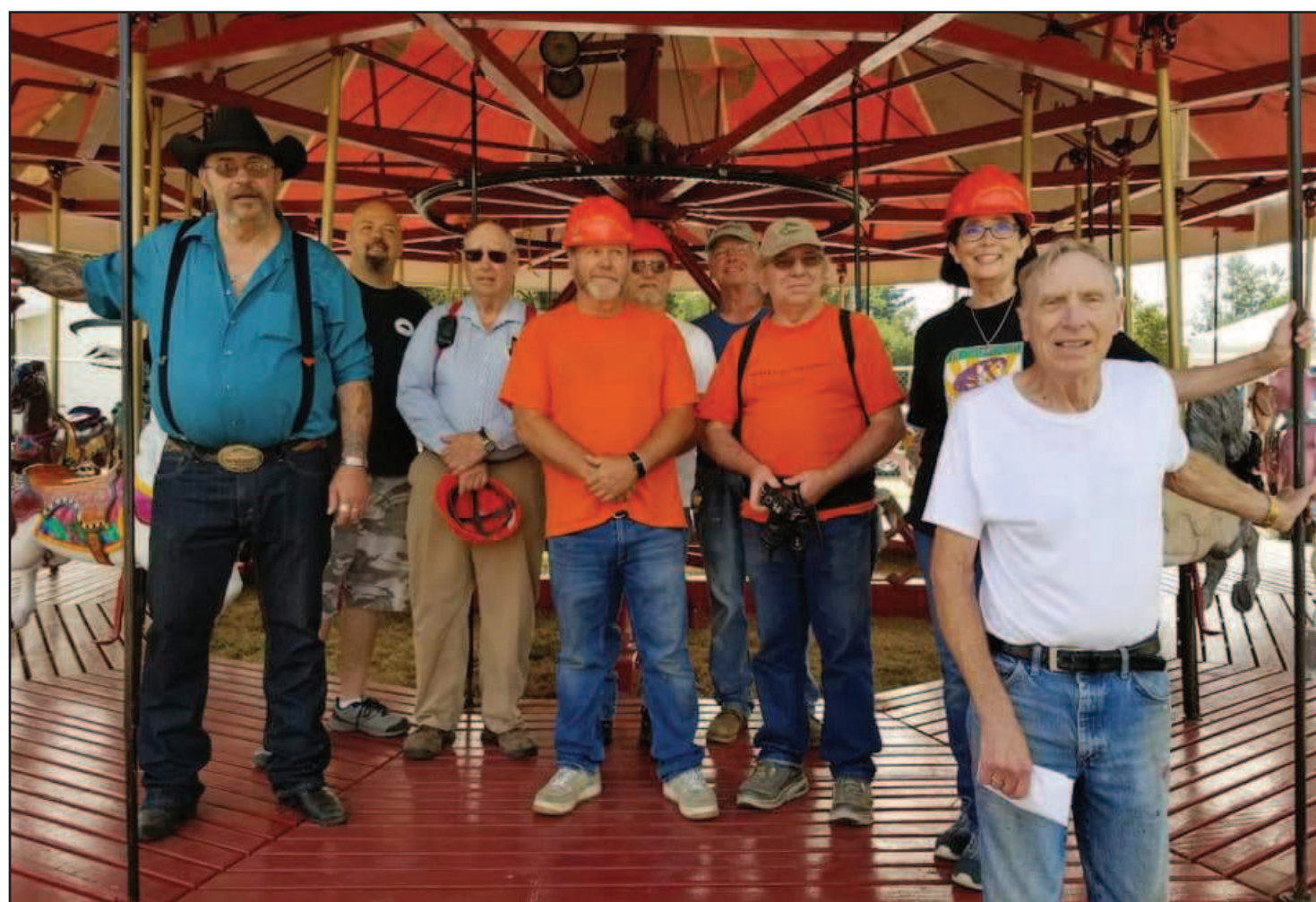
Friends of the Cottage Grove Carousel show off its progress on Saturday, Aug. 4

The Friends of the Cottage Grove Carousel are still committed to Cash's dream with several fundraisers held throughout the year and a new acquisition just months ago; an antique music box to