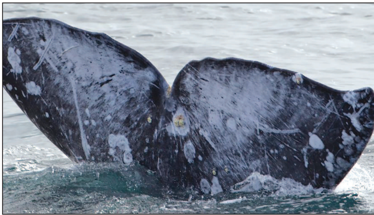
The tail of a grey whale surfaces following a breach of the Oregon coast.

The American Cetacean Society is the oldest whale conservation organization in the world, founded in 1967. The mission of this all volunteer non-profit is to protect whales, dolphins, porpoises and their habitats through public education, research grants and conservation actions. Information on the ACS can be found on the web-