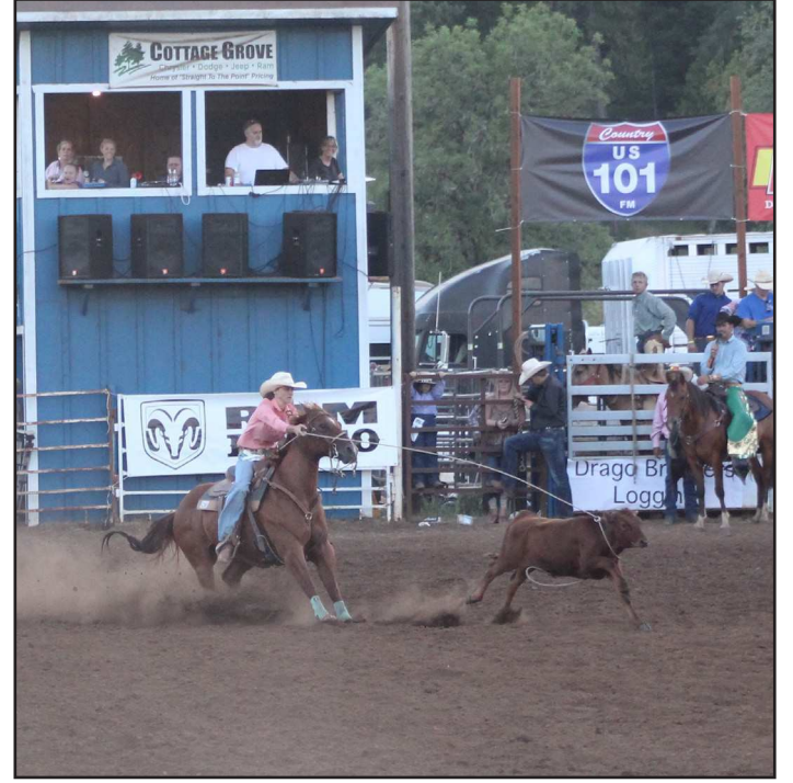
Rodeo competitors compete in calf riding (left), bareback riding (center) and calf roping (right) at the 70th annual Cottage Grove Rodeo over the weekend.