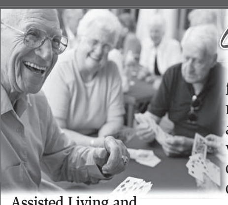
Assisted Living and Memory Care Apartments

The Cottage Grove Art Walk is unique, and so are the people you see there. It is full of fun, food, music, creativity, passion, and joy. If you check it out yourself, you might just make a fond memory or two. Even better, you may find the same inspiration the artists found.