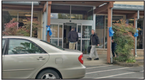
Local officials outside the library on April 30

Monday, April 30, bingo was abruptly interrupted after a suspicious package was reported at the Cottage Grove Library.