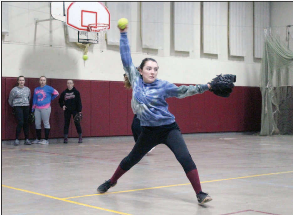
A North Douglas pitcher fires away during an indoor practice.