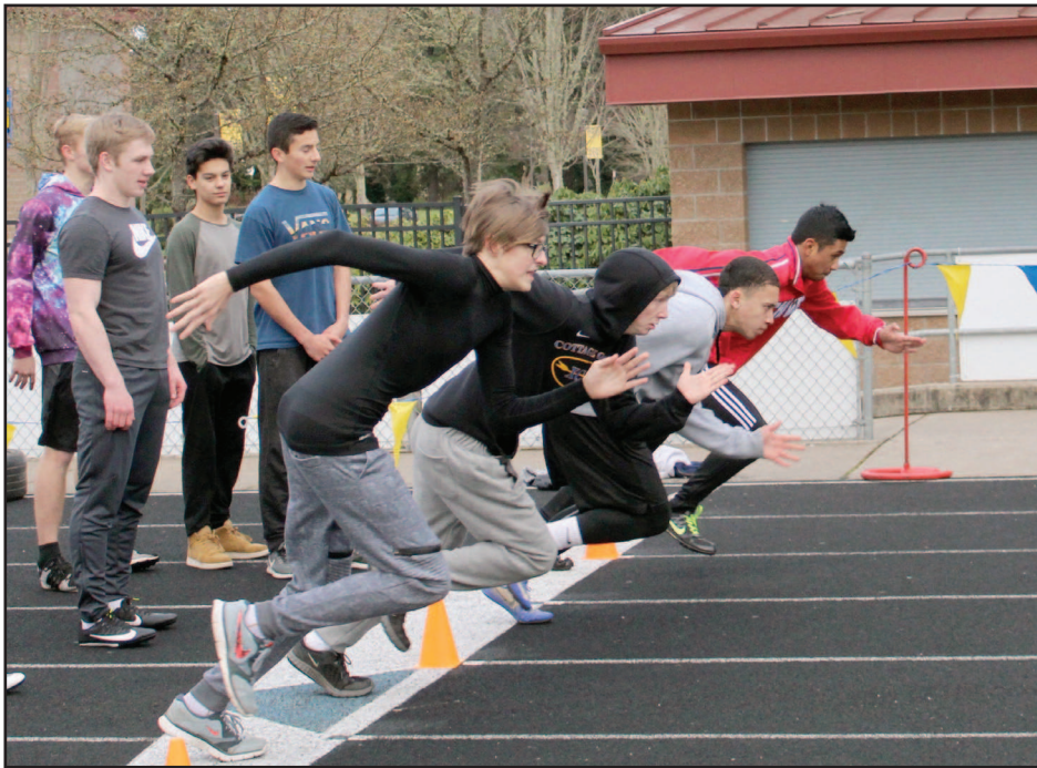
Cottage Grove sprinters complete a speed workout.