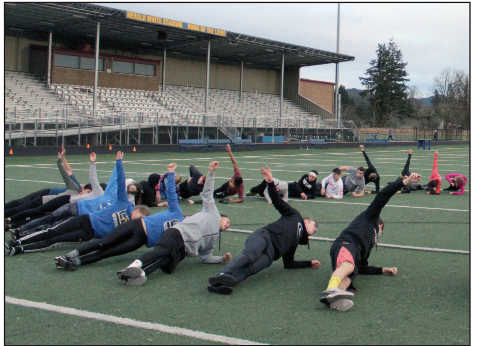
Cottage Grove sprinters and distance runners work on their core strength.