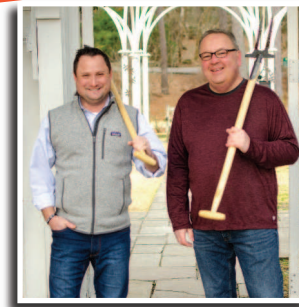
The Rose Kings Sustainability Tour! featuring The Redneck Rosarian Rose Garden Seminars Easy Care & Chemical Free ROSE PRIZES!