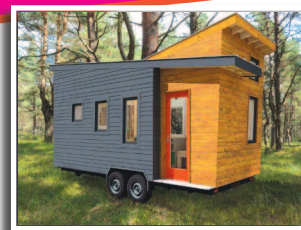
Tour a 121 Tiny Home!