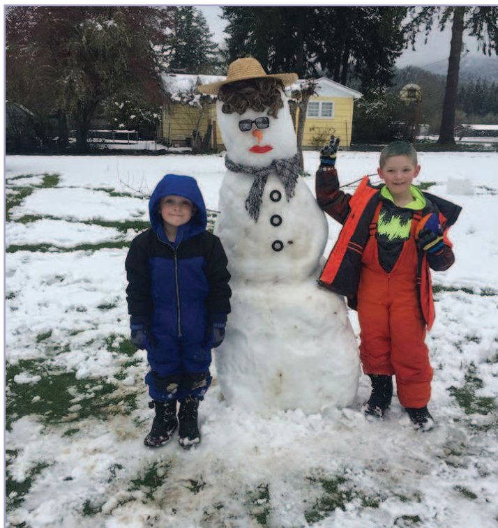
Submitted by Kary Peters