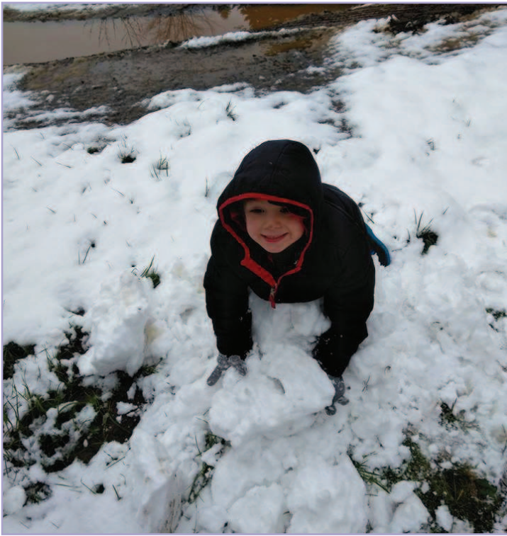
Submitted by Keri Rhoton