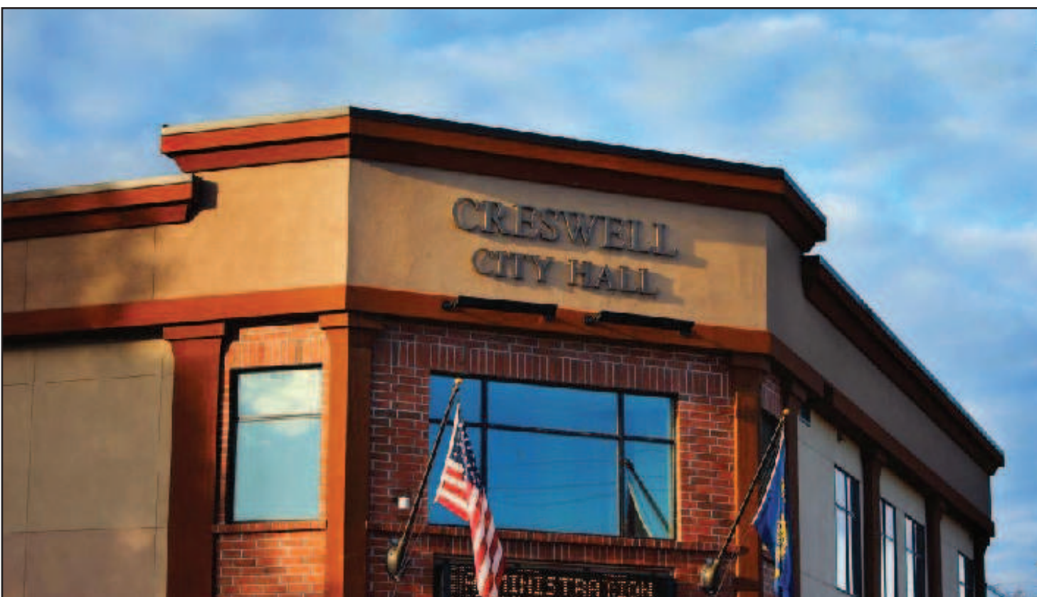
Windows and a door were damaged at Creswell City Hall on Sunday morning. A suspect is in custody and being charged with multiple offenses.