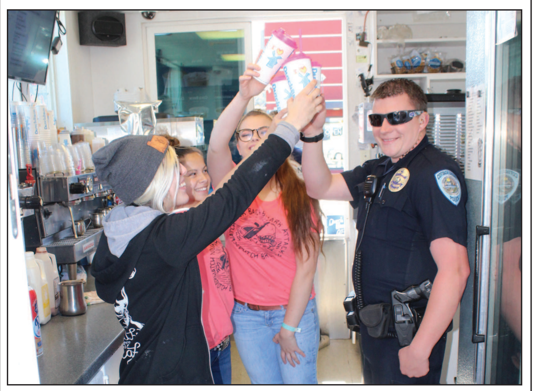
The Cottage Grove Police Department took part in "Coffee with a Cop" held across the nation on Wednesday, October 4. The event began as a grassroots movement to help police officers build relationships with the communities they serve. Cottage Grove officers were at the local Ducth Bros. location from noon to 1 p.m.