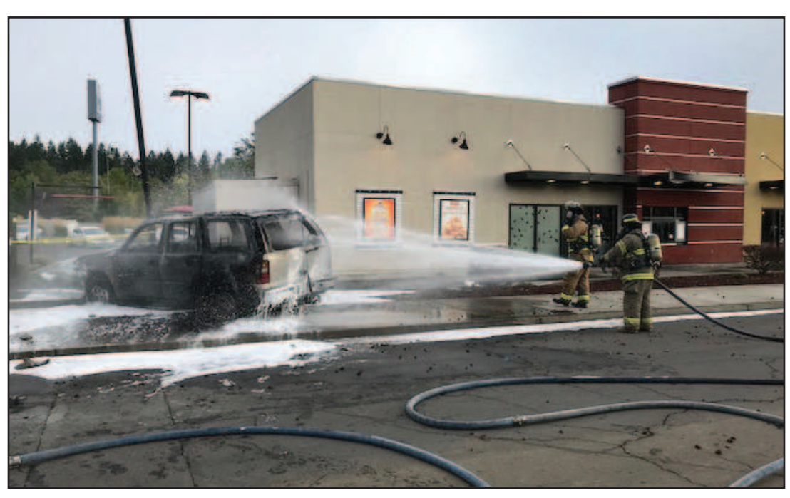
South Lane County Fire and Rescue (SLFR) puts out a car fire on October 3 after the driver suffered a medical emergency and lost control of the vehicle.

According to authorities, the incident began in the drive-thru of Jack in the Box on Gateway on the morning of October 3. An unidentified 72-year-old man apparently suffered a medical emergency while behind the wheel, lost control of the vehicle and ran into a power pole and box, damaging the infrastructure. The vehicle caught fire and according to SLFR and Cottage Grove Police, authorities on the scene as well as bystanders pulled the man from the vehicle to safety.