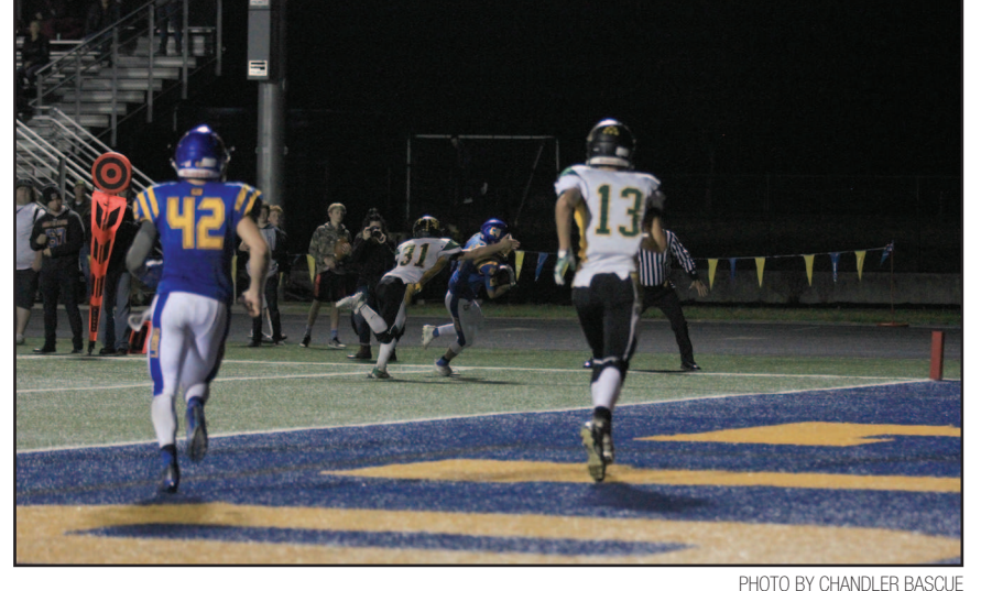
A Cottage Grove receiver looks to find the end zone.

The Lions will now move on to face the Sisters Outlaws (2-3) on the road next Friday.