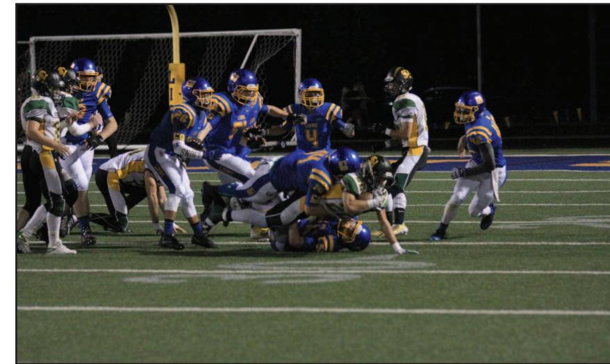
The Cottage Grove defense shuts down the Sweet Home run game.