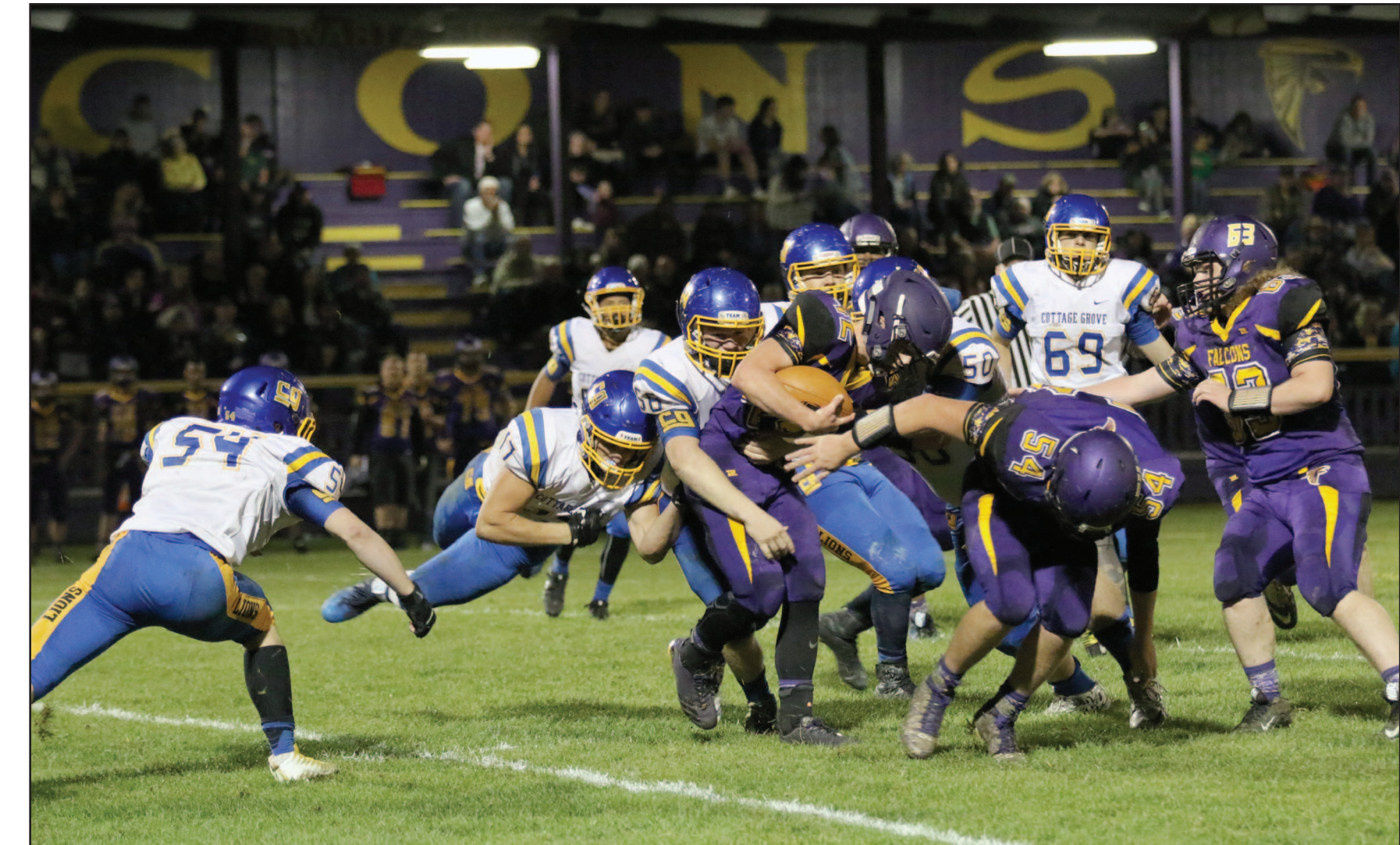
A swarm of Cottage Grove defenders take down Elmira's running back