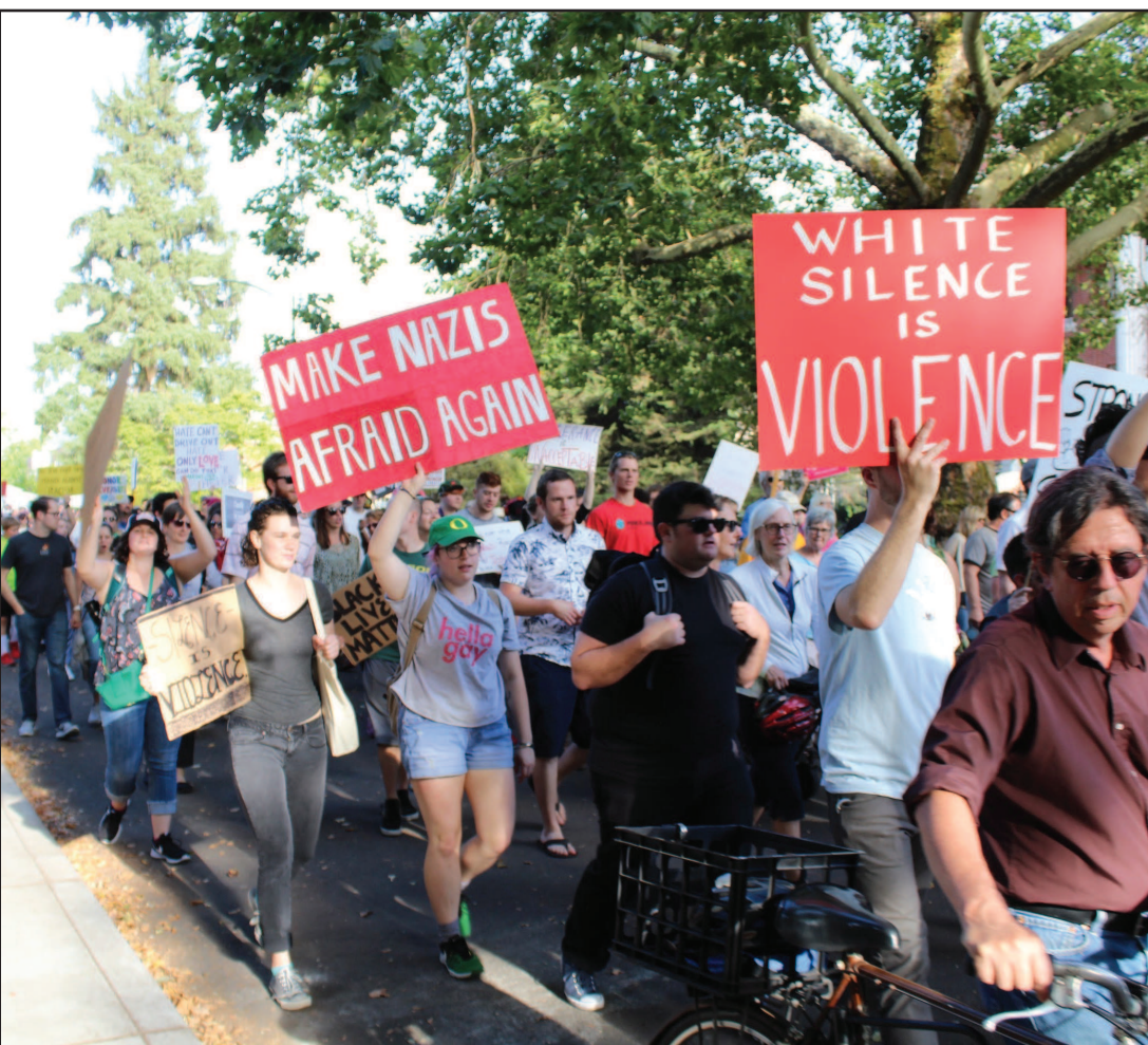
Approximately 2,000 people marched in Eugene against the events in Charlottesville, Virginia last week. The march started at University of Oregon and ended downtown at the courthouse with speakers rallying the crowds.

NEW: Digital X-Rays (use less radiation)