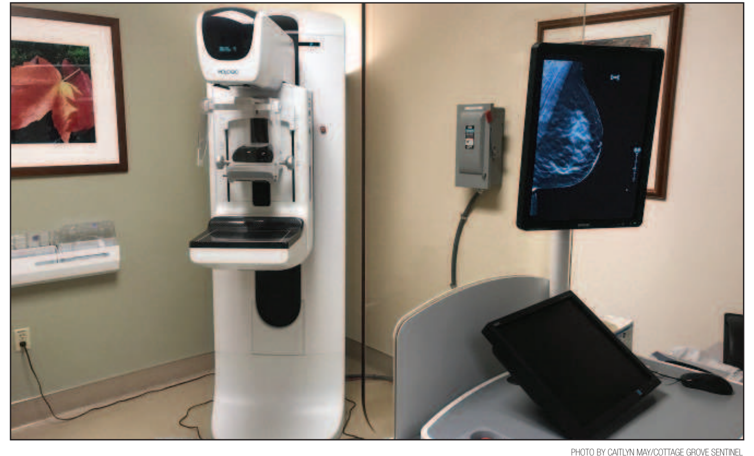
PeaceHealth's Cottage Grove clinic debuted its new 3D mammography machine in June. The technology replaces the 2D machine and helps professionals better screen denser tissue and provides more accurate readings.