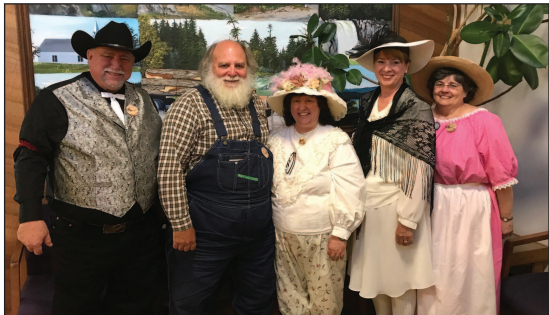
The Bohemia Mining Days Board put a request out for volunteers to help set up and take down the event during the city council meeting on Monday, June 26.