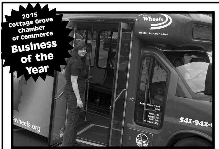
LOW COST Local & Metro Weekday Trips Professional Caring Staff

914 South 4th St. • CG • 541-942-1559 douglasgmaddessdmd.com