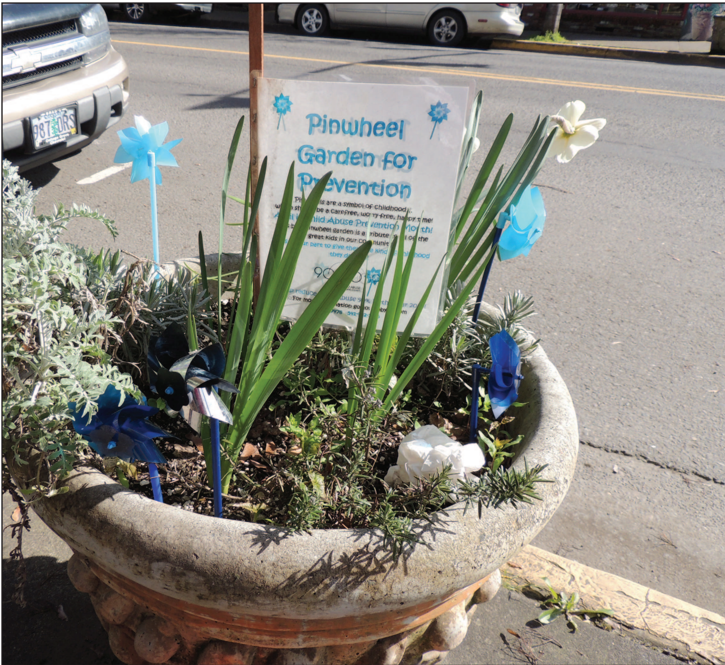
Decorations are popping up all over Cottage Grove to raise awareness of Child Abuse Prevention Month.