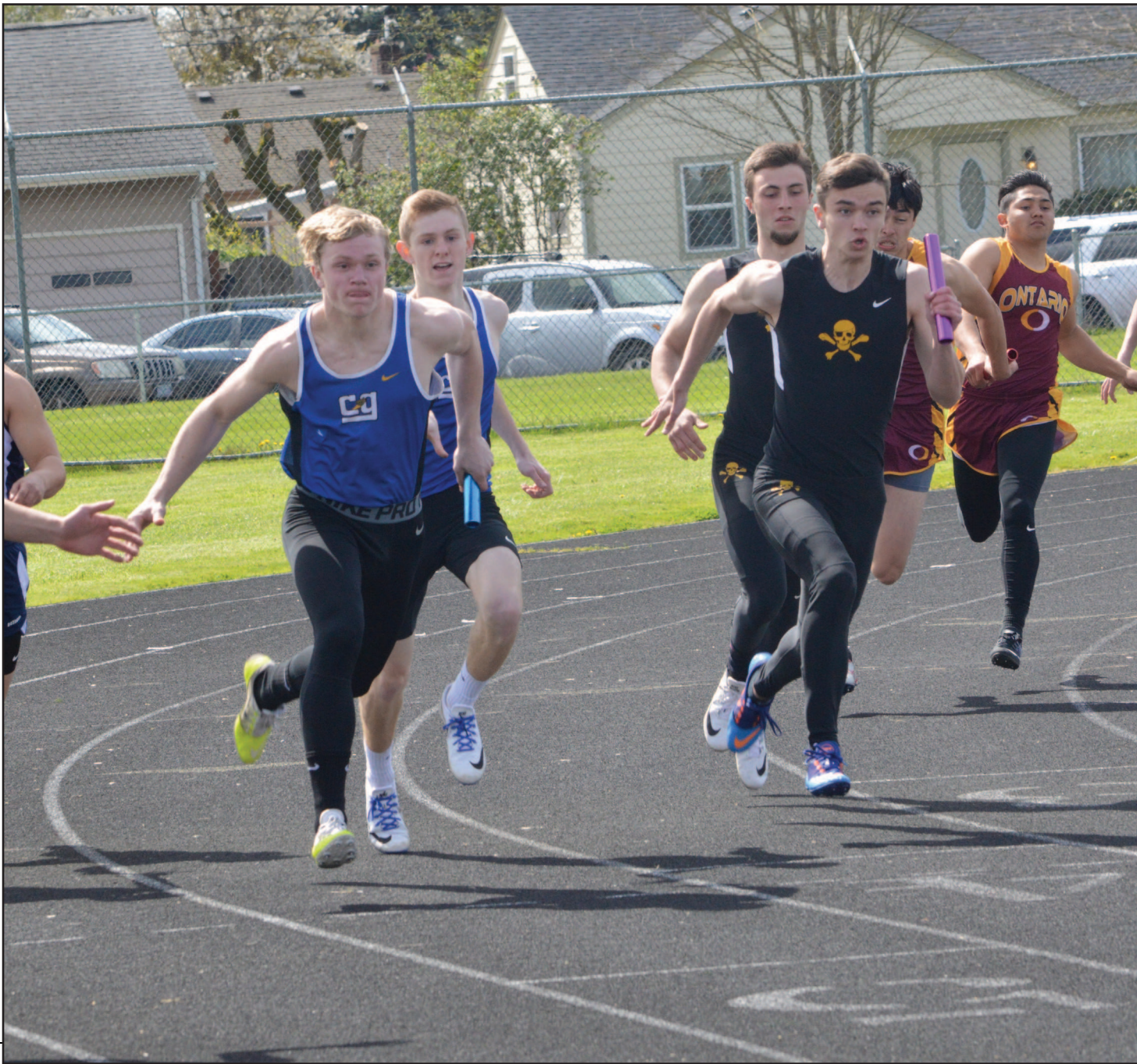
The Cottage Grove High School track teams ran two meets last week, opening the season on Thursday against Junction City and Pleasant Hill.