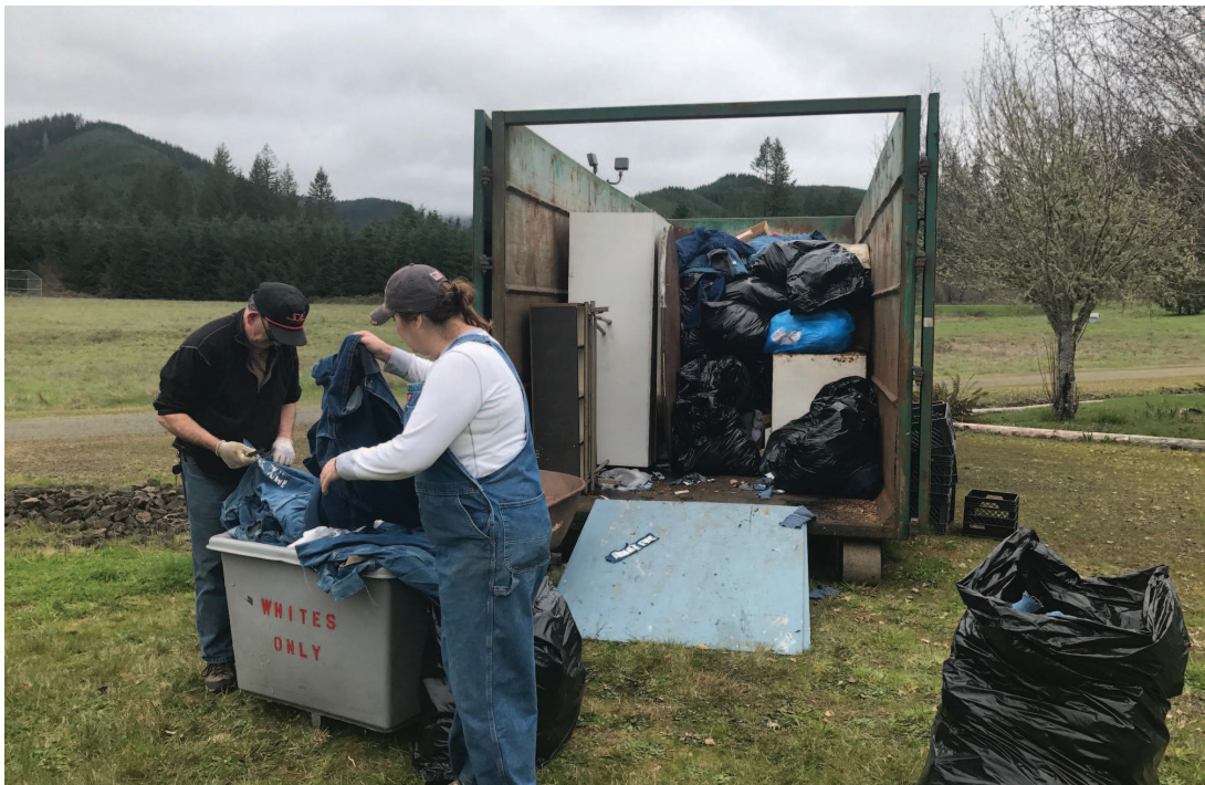
Volunteers helped rid a former inmate camp of leftover belongings to make room for a new veteran camp.