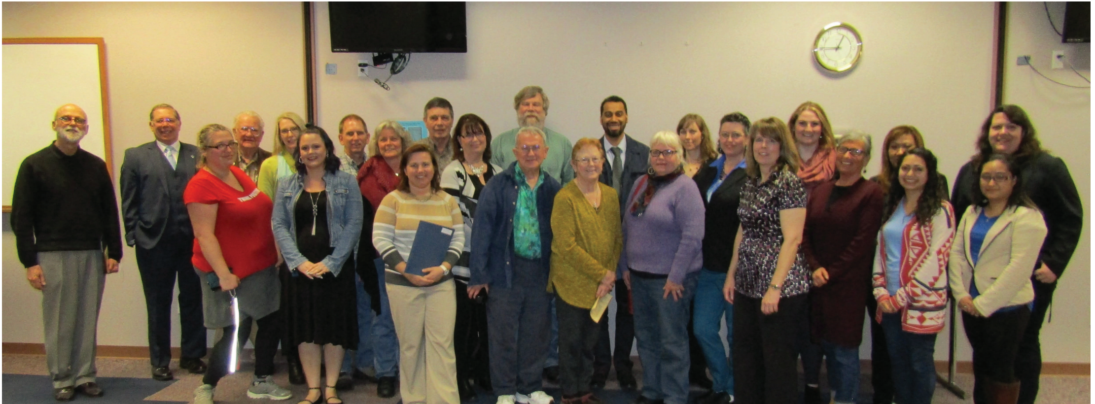
The Cottage Grove Community Foundation awarded these outstanding non-profit organizations at the Community Grant Awards ceremony on Tuesday, March 14.