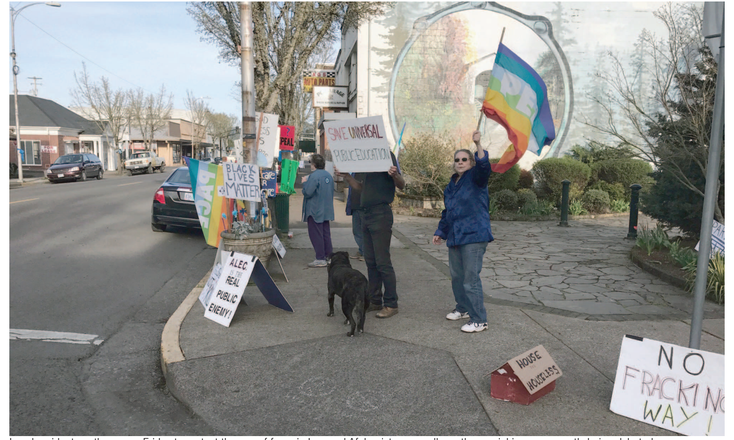
Local residents gather every Friday to protest the use of force in Iraq and Afghanistan as well as other social issues currently being debated.