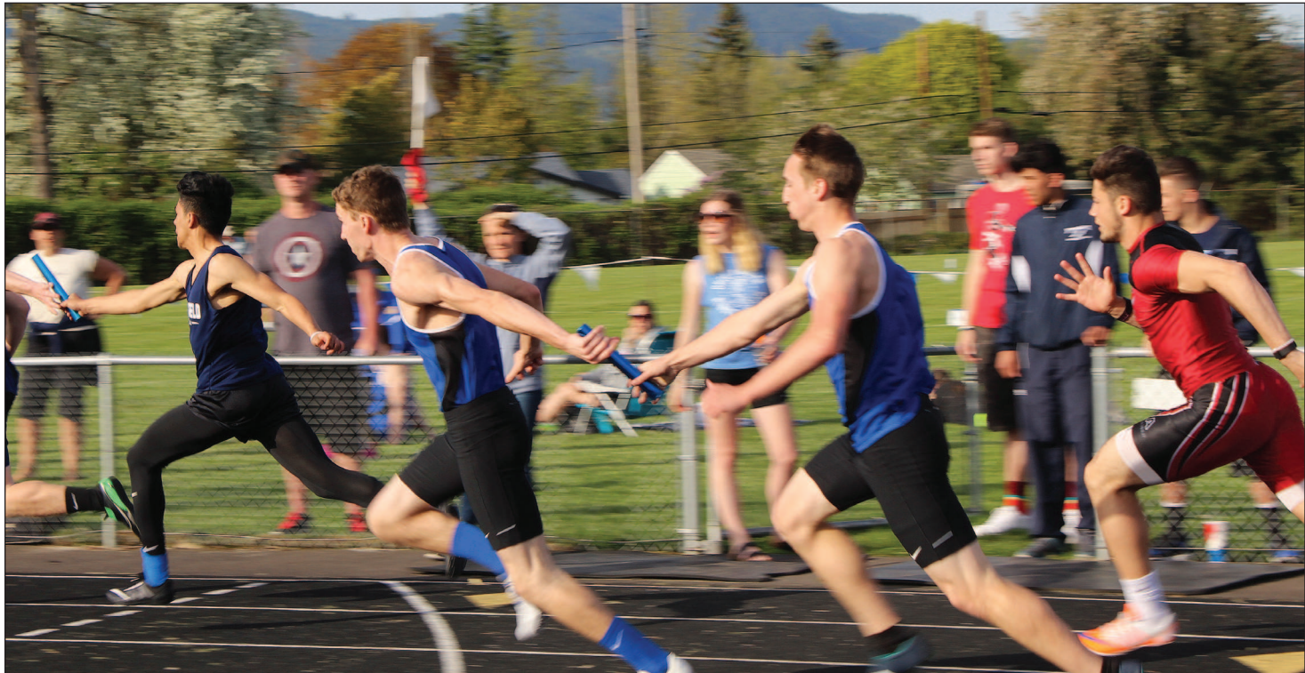
Cottage Grove's 4x100-meter relay team broke a school record last year that stood for 12 years. The team got silver in the district meet when the boys won a Sky-Em League title, the first for CGHS in five years.