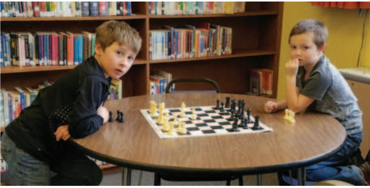
Two Latham students play chess.