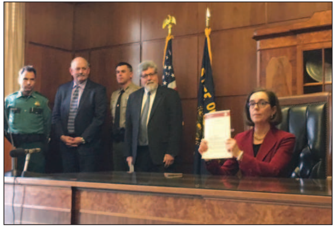
Oregon Governor signed an executive order on Feb. 2 extending a current state law prohibiting law enforcement from acting solely on an individual's immigration status.

(5) As used in this section, warrant of arrest has the meaning given that term in ORS 131.005 (General definitions). [1987 c.467 §1; 2003 c.571 §1]