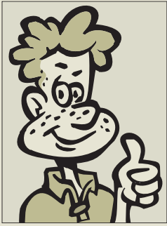
Student Myron Fleming feels the new rule is "long overdue."

SPOTTVILLE, USA – The Spottville school board passed a new rule last night giving Spottville children with freckles more privileges than children without freckles.