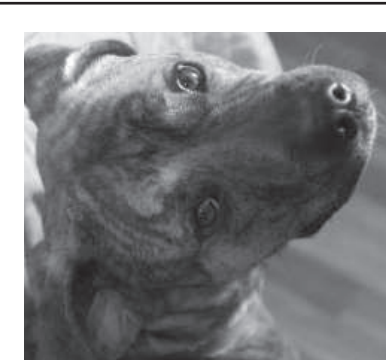
HEALTHY PET 541-343-3411