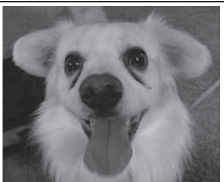
COTTAGE GROVE SENTINEL 541-942-3325