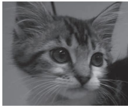
COTTAGE GROVE SENTINEL 541-942-3325