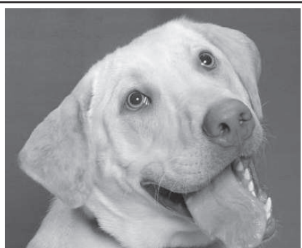
OLD MILL FARM STORE 541-942-3042