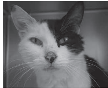
COTTAGE GROVE SENTINEL 541-942-3325