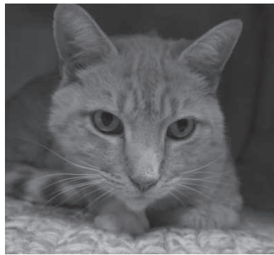
HEALTHY PET 541-343-3411