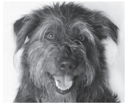
COTTAGE GROVE SENTINEL 541-942-3325