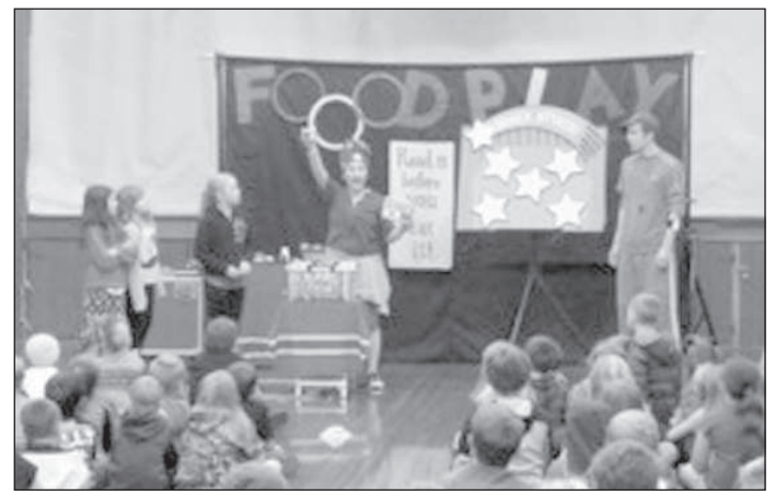
London and Latham students watched a theater performance entitled "FOODPLAY" on Sept. 29.