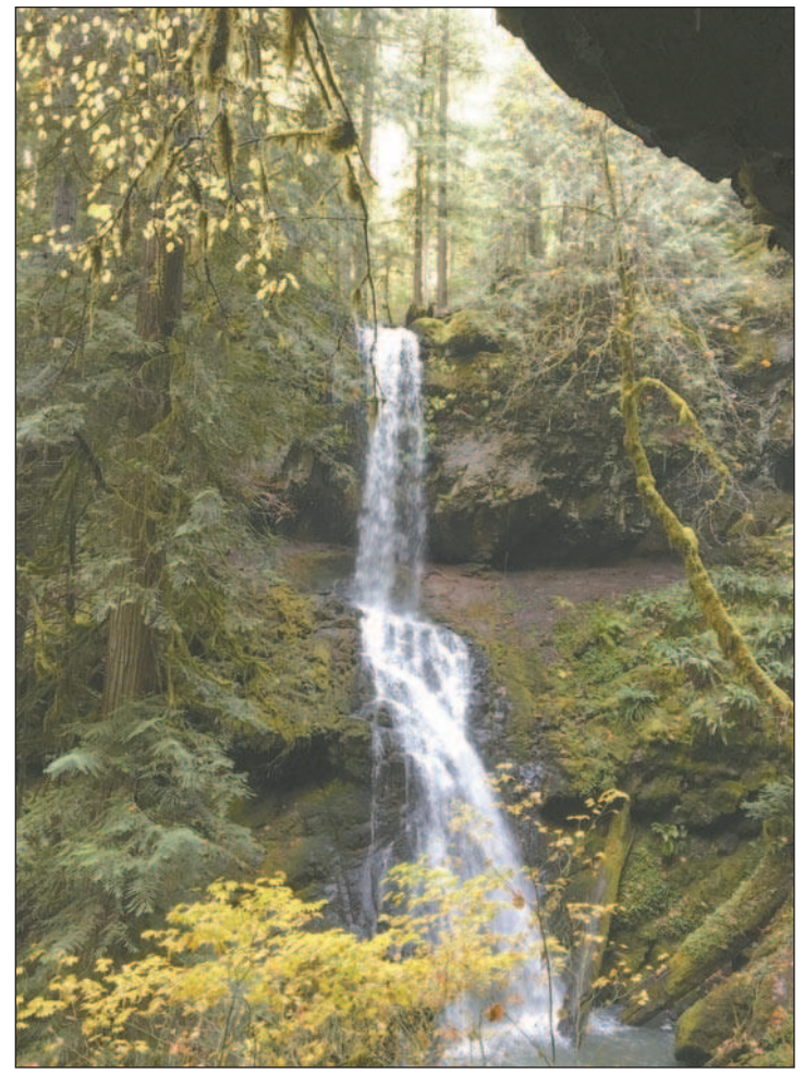
Trestle Creek Falls showcases its power following recent record rainfall.