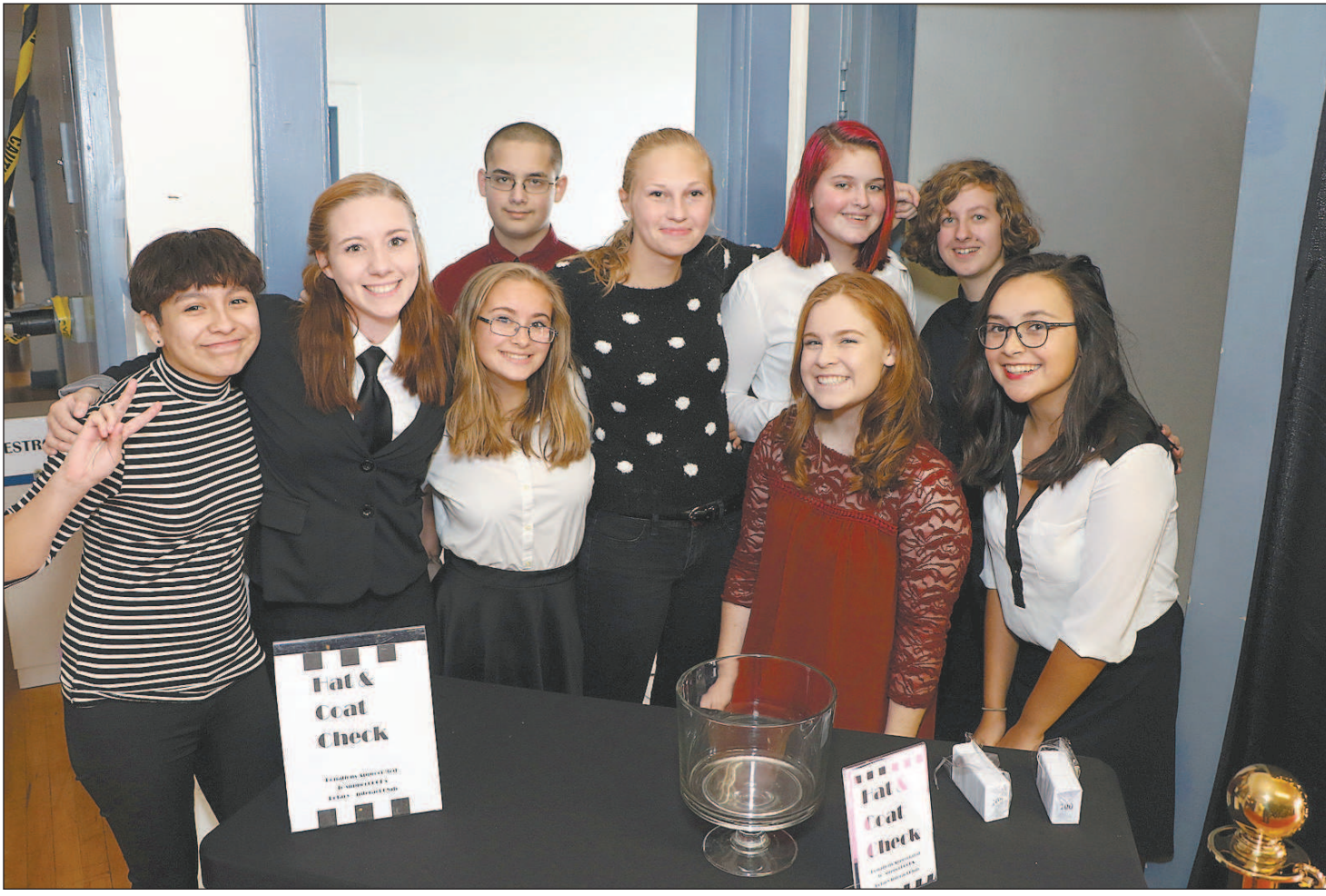
Members of Cottage Grove's Interact Club pause from their many duties for a quick pic during Saturday's Mayor's Ball.

Email photo submissions to: cgnews@cgsentinel.com