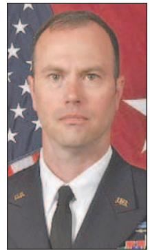
Brigadier General William Edwards commands the National Guard's Land Component.

ing of Cottage Grove not to exceed $463,000 to secure the needed funds. The Army has seen sporadic use since its purchase, and conceptual drawings have been planned and executed for the building, plans that detail possible uses including a commercial kitchen, emergency shelter, headquarters of the Cottage Grove Kids Club and more.