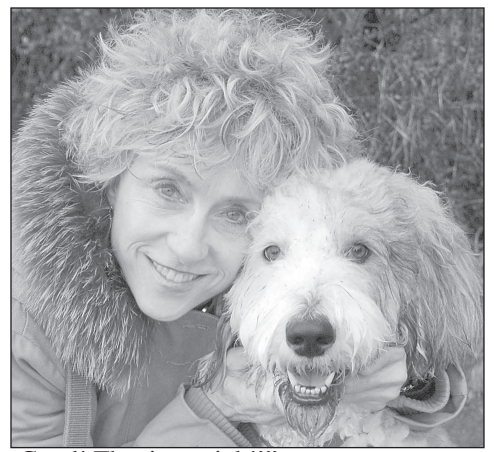
Good! That is my job!"

He has a gentle giving spirit and when I look into his face I 'hear' his 'voice' in a slow Southern accent: kind of low-goofy-gravely sound brimming with kindness slowly saying, 'I've heard that I make people smile.