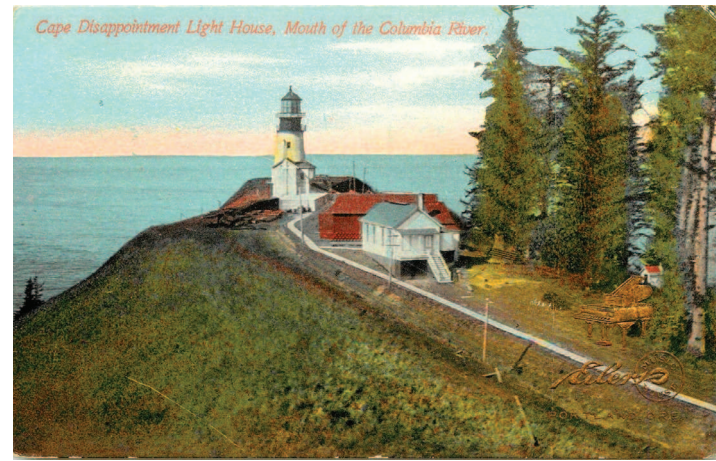
An early-1900s postcard image of the Cape Disappointment Light on the north side of the Columbia Bar, the first lighthouse built in the Northwest. Ironically, it was delayed several years after the bark Oriole, carrying building supplies for the project, sank on the bar.

By the time it was done, the South Jetty had already changed the flow of the river. In place of the old fan-like network of treacherous channels through the sand, the current of the river had now scoured a single channel 30 feet deep along the jetty and out to the sea. It had cost just over $2 million to do - well under the budget estimates of $3.8 million, but still one of the biggest U.S. government projects of the 19th century.