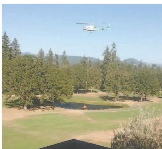
CORRECTION: A reader captured this back-porch photo of a helicopter taking water from Hidden Valley Golf Course to fight a fire on Mt. David on Wednesday, Aug. 24. The Sentinel had incorrectly reported that the water was taken from the Coast Fork of the Willamette River.