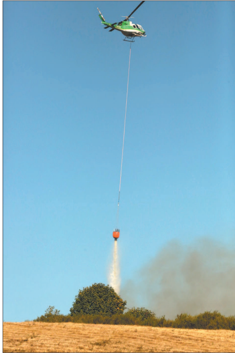
A helicopter pilot douses flames near the summit of Mt. David, as witnessed from a nearby backyard, on Wednesday, Aug. 24.