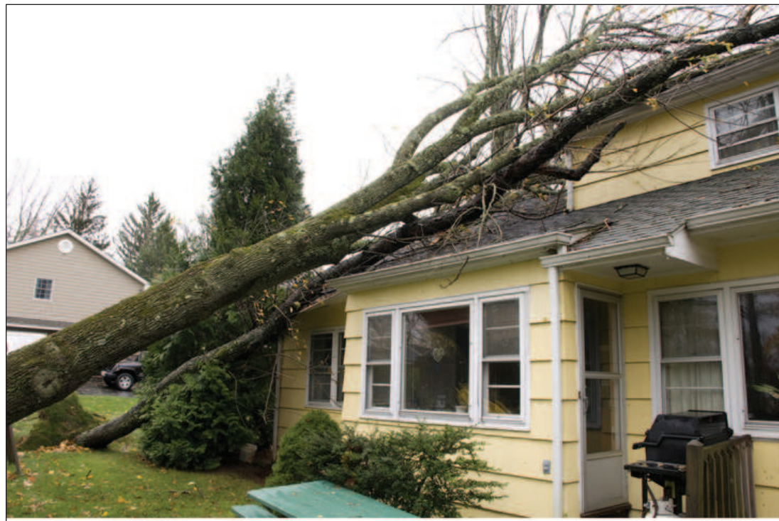
Home-Building Innovation: Ask your builder about disaster-resilient construction

Donating in the wake of a natural disaster is a thoughtful gesture. But donors must be on the lookout for scammers looking to take advantage of their generosity.