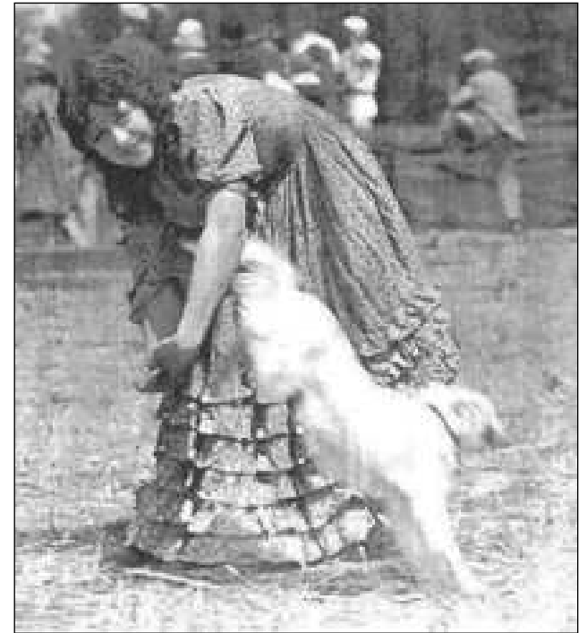
The arrival of leading lady Marion Mack, who reportedly enjoyed driving around the countryside unaccompanied in a new automobile, must have caused quite a stir in this once-sleepy timber town.

It is going to be hard to get anything done in Cottage Grove while Keaton and company are here. The actors will have a large audience every day.