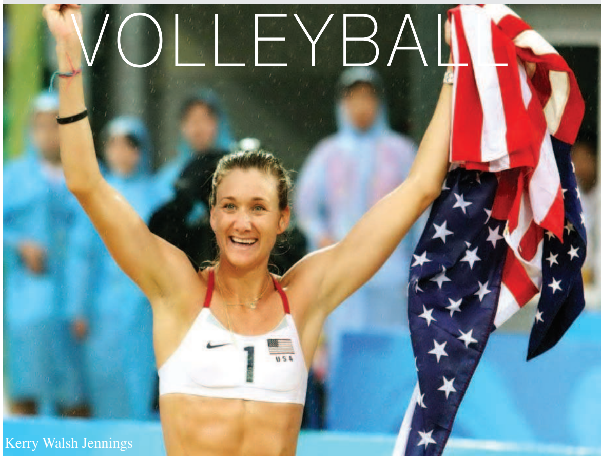
Kerry Walsh Jennings