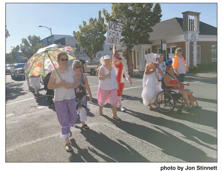
The Bloomers Parade returned to celebrate Women's Suffrage on Thursday.