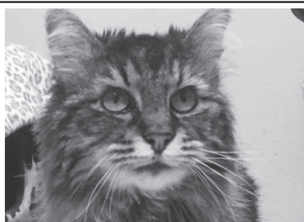
BOCHETTO DAY SPA 767-1616