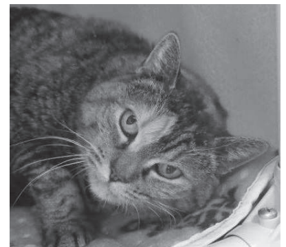
WAGS DOG EMPORIUM 541-343-8801