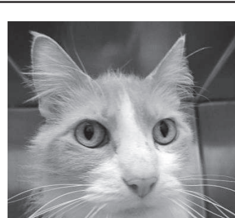
COASTAL FARM AND RANCH SUPPLY 541-687-5810