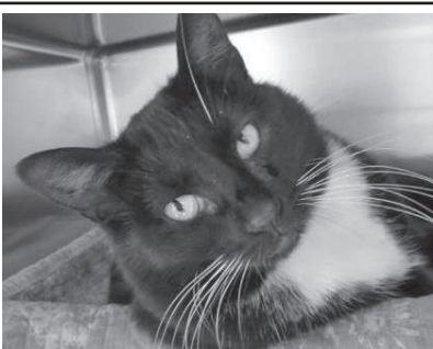
COTTAGE GROVE SENTINEL 541-942-3325