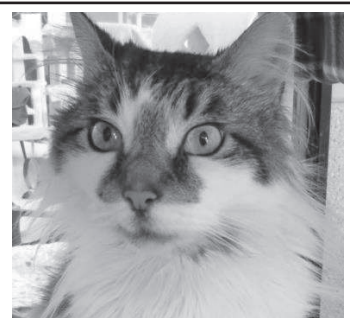
HUMANE SOCIETY OF COTTAGE GROVE 541-942-3130