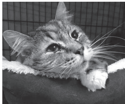
COTTAGE GROVE SENTINEL 541-942-3325