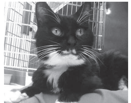
OLD MILL FARM STORE 541-942-3042