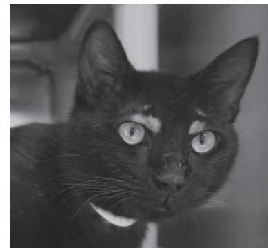
SOUTH WILLAMETTE VETERINARY CLINIC 541-895-5665