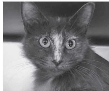
COASTAL FARM AND RANCH SUPPLY 541-687-5810