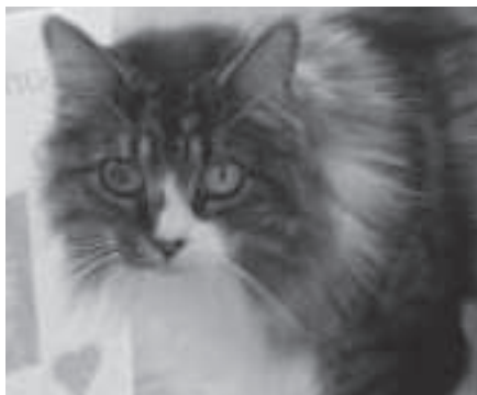
HUMANE SOCIETY OF COTTAGE GROVE 541-942-3130