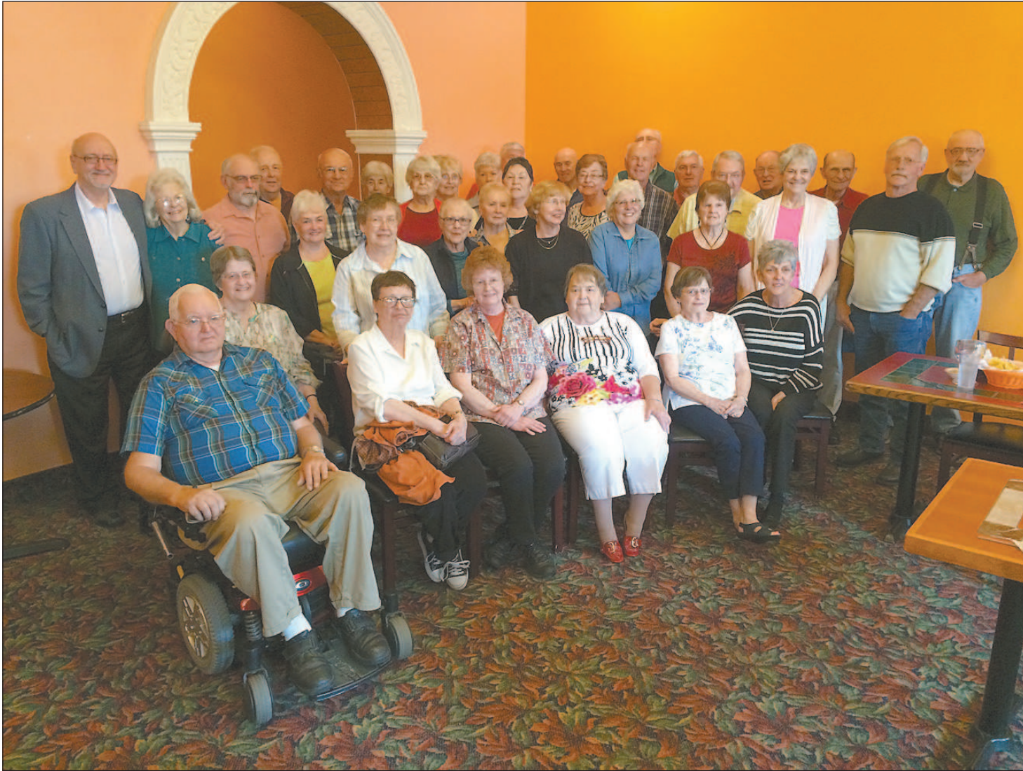
The Cottage Grove High School class of 1959 recently gathered at El Tapatio restaurant.

Community snapshots from community members