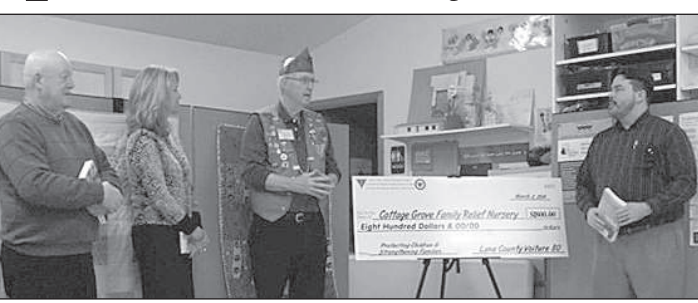
The 40&8 held its quarterly gathering in Cottage Grove, later donating to support therapeutic classrooms.

Family Relief Nursery said it is using the donated funds to support therapeutic classrooms for children from six weeks to six years old. These classes are located in both Cottage Grove