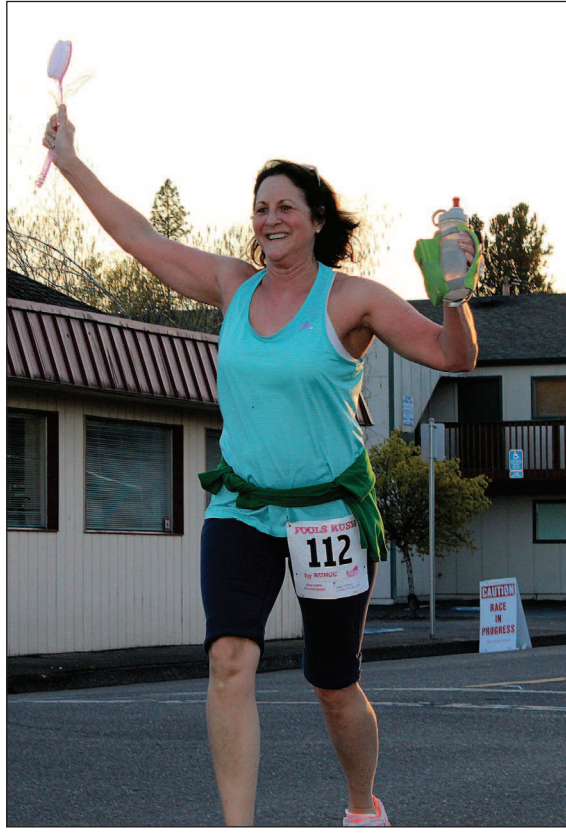
At the top of Mt. David, runners were given random objects to return to the finish line with to give a jokster's spin to the run.