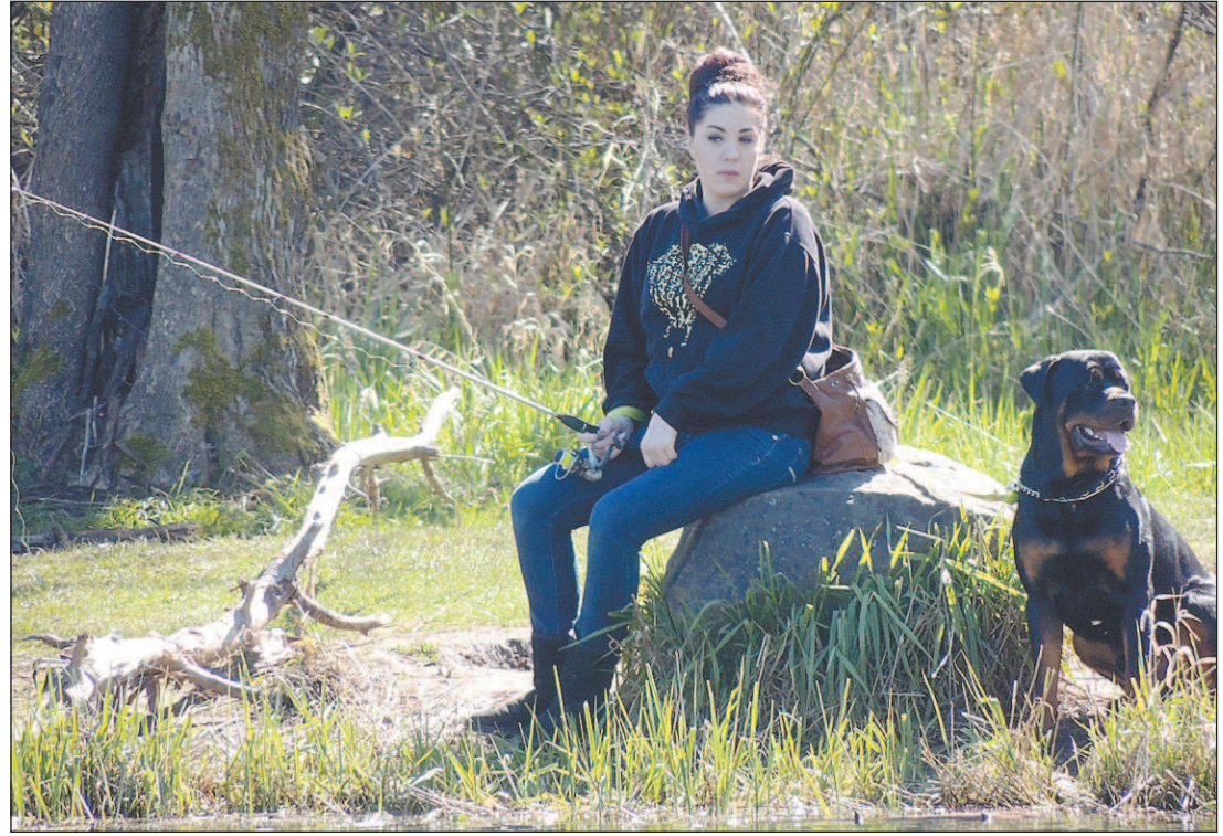
Canine friends accompanied many anglers.

Family fishing event Saturday, April 9, beginning at 9:30 a.m.