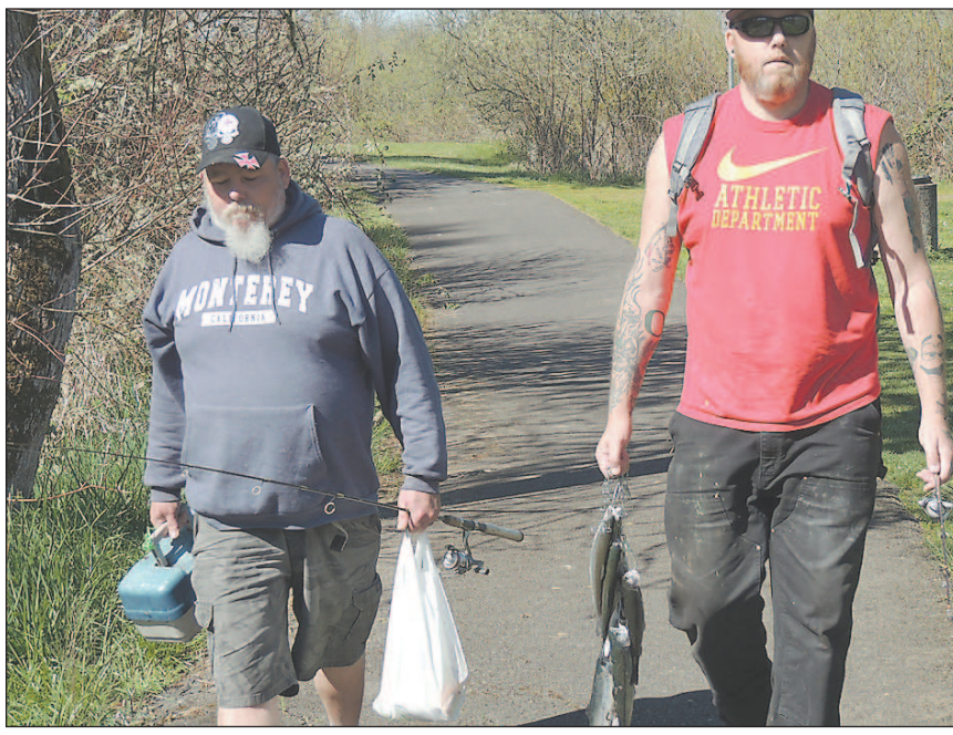
Persistence and skill paid off for these fishermen, who each left the pond with a limit of five hatchery-raised trout.