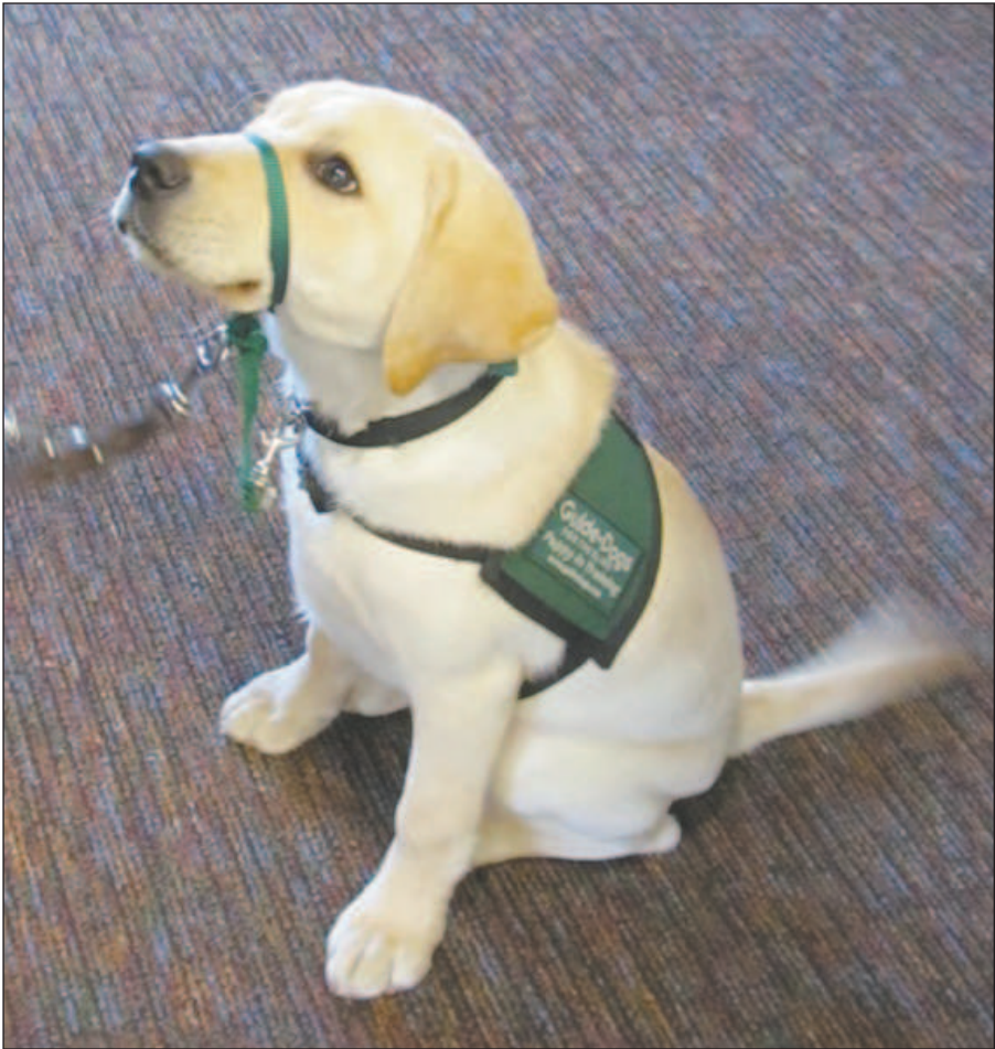
A guide dog in training (no, the leader doesn't hurt!)

Kimberly and Jackie are their veteran Eugene puppy trainers, having trained about 13 pups between them. Here are some things you'll need to know if you're thinking of being a puppy raiser: The dogs go everywhere with them that is open to the public. They are taught good house and public manners. They practice positive re-enforcement. Bad behavior is ignored. Pups are on a strict natural balance diet. No table food or treats. Good behavior is rewarded with "one"