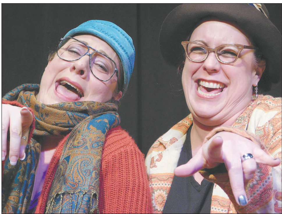
Pagniano and Major brought dozens of characters to life in 'Parallel Lives.'

In the opening scene, Pagniano and Major are portrayed as two angels sitting above the world and discussing how to create man and woman. They bargain and discuss what aspects of life to give which gender. They con-