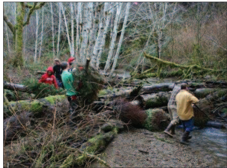
Reedsport Community Charter School students and staff put Christmas trees in Buck Creek.