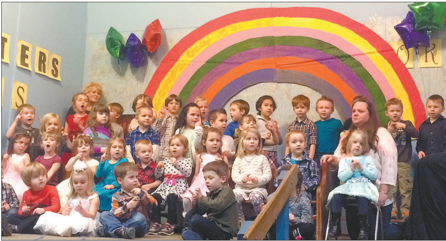
Organizers say that about 125 people attended an annual family night at Great Days Early Education Center, an evening that featured entertainment by the school's preschool singers.