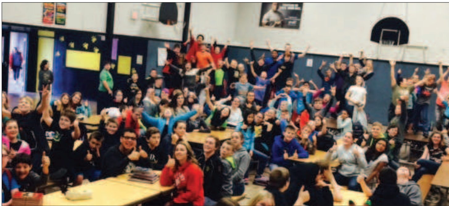
Recognizing the kids who have outstanding attendance