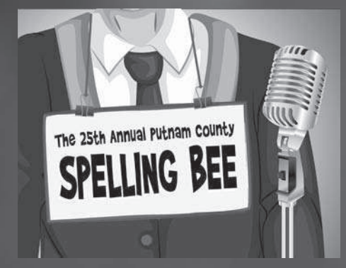
June 10 – 26, 2016 A fanciful fun-filled farcical frolic!

January 29 – February 14, 2016 A hilarious musical romp through middle school