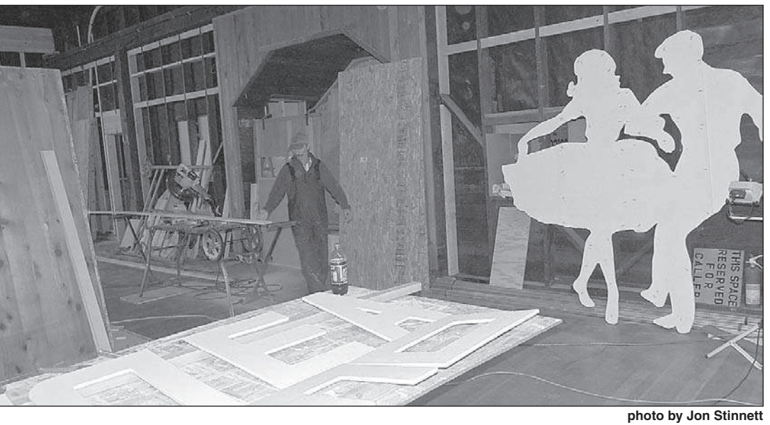
Work continues on the Boots and Sandals Square Dance Barn as its iconic dancers await their reinstallation on the building's facade.

Currently housed at 737 E. Main St., the Gold Mining Museum and Historical Society have shared a building since the Museum relocated from a building across Main Street and the Historical Society moved from space it occupied upstairs in the