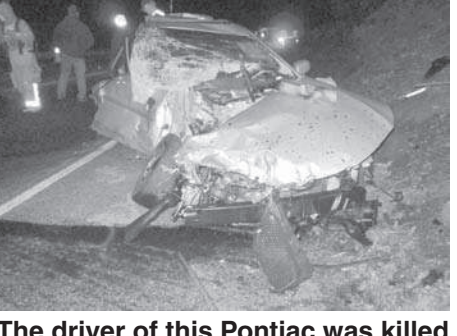
The driver of this Pontiac was killed in a three-vehicle accident on Nov. 29.

Preliminary information indicates a 2006 Pontiac sedan was traveling westbound on Highway 26 when it slowed to make a turn onto Highway 103. While the Pontiac was momentarily stopped waiting for passing traffic, it was rear-ended by a 1992 Ford F350. This impact pushed the