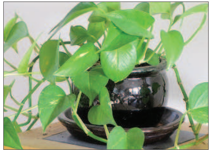
Monitor early and often for insects, including aphids and mealybugs, to keep houseplants such as this pothos pest-free.

Another trick, she said, is to place aluminum foil or reflective mulch around the base of a plant. This may disorient winged pests like thrips and aphids and discourage them from landing.