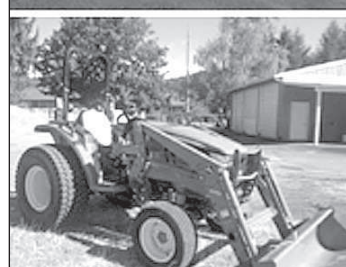
The City of Cottage Grove took delivery of a new street sweeper and tractor last week.

County. The Elgin street sweeper was used as a trade-in against the purchase price of the new Schwarze street sweeper. The