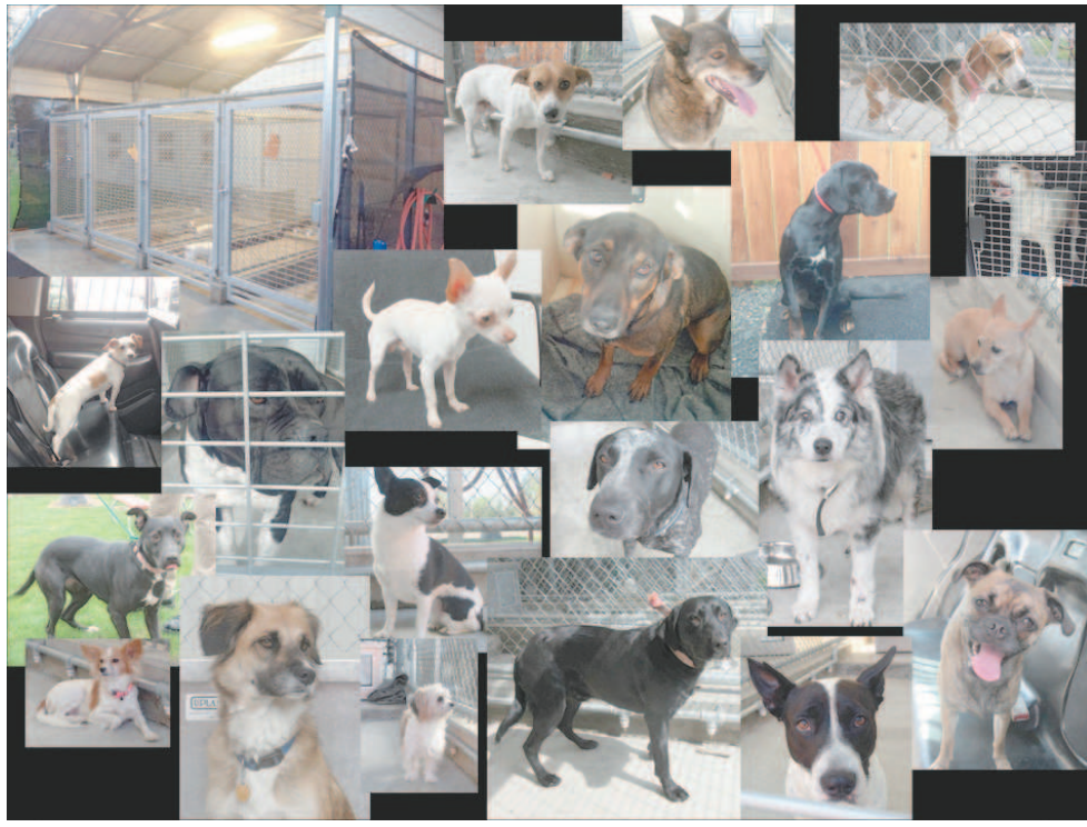
This photo compilation shows some of the dogs that have been housed at the City of Cottage Grove kennel. So far, the kennel had housed 56 dogs by the end of last week, most of which had been reunited with their people.

According to Meyers, the City has housed 56 dogs at the kennel, 47 of which have been reunited with their people. Six dogs were delivered to the First Avenue Shelter